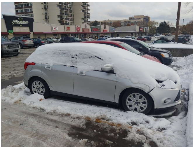
Car covered in snow after the snowstorm November 11th

But it's not just about the tires. Daley also said, "A good winter driver should be prepared for anything. It's important to have the necessities such as a first aid kit and flashlight. But the one thing all Canadians should have is a snow brush with an ice scraper and something to give your car traction support when you're stuck in the snow, kitty litter works great but if you can get road salt, it would help with the ice and snow."