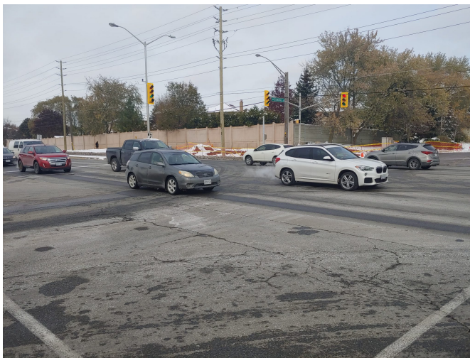
Traffic on Trafalgar Rd. near the Sheridan campus